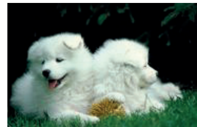
Similar allergens in Dogs and horses are called Can f1 and Equ c1 (0.5-20 microns)